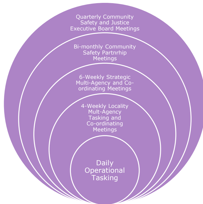
Figure 3 Dundee Community Safety Co-ordinating Structure