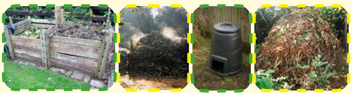
Examples of hot composting

Typical cool composting utilises the standard "Dalek"- type plastic compost bin or a simple open heap in the corner of the plot or garden, while the hot composting method requires a heap of at least 1 metre square or an insulated bin/box of equal size - commonly used here is the "New Zealand Box" type of compost bin.