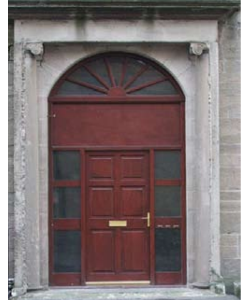
Modern replacement door - not respecting original proportions