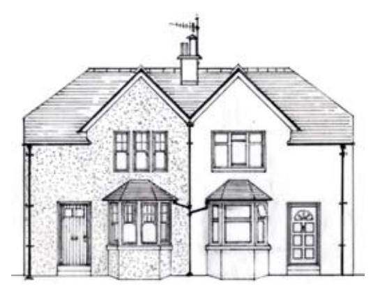
Impact on character due to altering window type