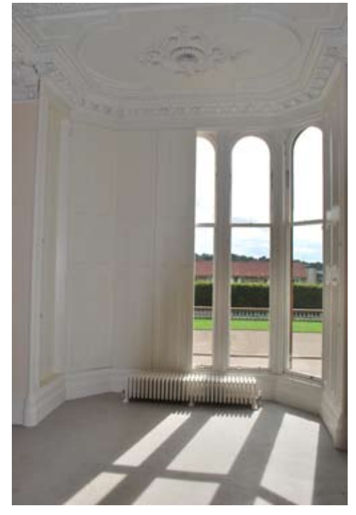
Original historic windows with timber shutters