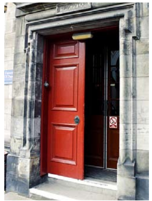
Historic timber panelled door