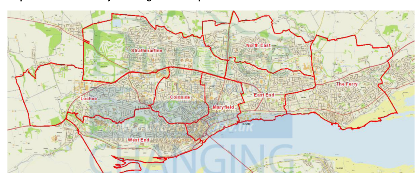
Map 2. Local Community Planning Partnership Areas

The following information identifies the eight Local Community Planning Partnership Areas where potential new housing developments throughout the City may be developed over the next 5 to 30 years.