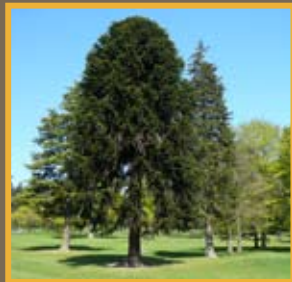
No 17 monkey puzzle