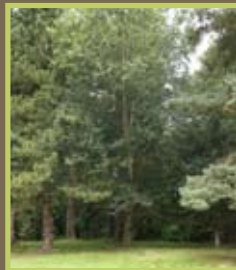
No 3 Himalayan birch

Collections like this one at Camperdown Park are a living museum, testament to the skills, endurance and vision of the early plant hunters and landowners, who laid the foundations of Scotland's modern forestry industry. With our temperate climate and expertise in tree cultivation, Scotland has a vital role to play in securing the future of the world's conifers, a third of which are threatened by habitat destruction and climate change in their native lands.