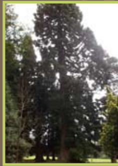
No 5 giant redwood

The National Tree Collections of Scotland was established by Forestry Commission Scotland and the Royal Botanic Garden Edinburgh to raise awareness of Scotland's tree collections, and to protect and enhance them for the future.