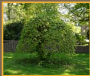
No 25 Camperdown elm