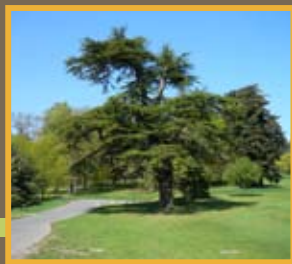
No 16 cedar of Lebanon