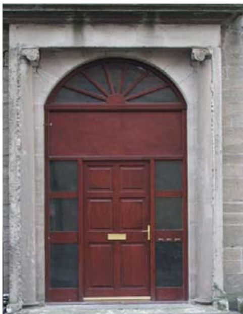
Modern replacement door - not respecting original proportions