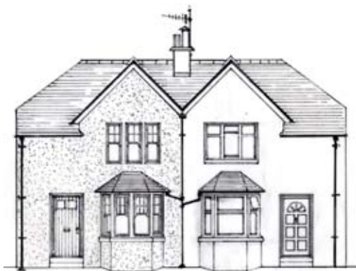
Impact on character due to altering window type

5.1 Planning Permission is not normally required for the replacement of windows and doors that fully comply with Dundee City Council's Policy on Replacement Windows and Doors. There are 3 different categories with reference to the Council's policy, properties which are Listed Buildings, unlisted buildings located within a Conservation Area and those neither a Listed Building nor within a Conservation Area.