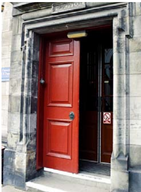
Historic timber panelled door