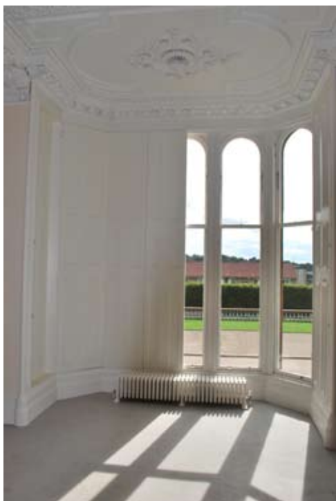
Original historic windows with timber shutters

7.2 Planning permission is not normally required for replacement windows matching or replicating the existing colours and proportions.