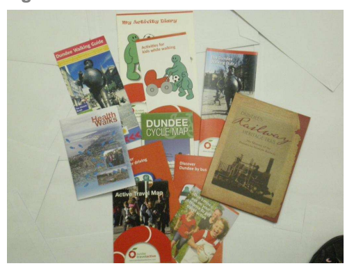
Figure 4 Selection of resources

Every householder participating in the project also received a copy of 'Discovering an active lifestyle' leaflet which gave general information on being more active and how Dundee Travel Active could help.