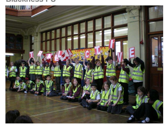
Figure 9 Assembly presentation at Blackness PS

In June 2010 we revisited some of the schools where we had previously held sessions to undertake 'hands-up' surveys of pupils in order to evaluate the outcomes of the workshops.