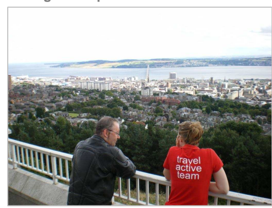
Figure 8 Travel Advisor with participant during walk up Dundee Law

"I didn't realise Dundee has so many nice walks"