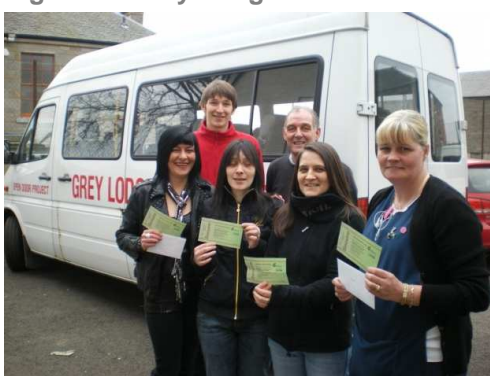
Figure 13 Grey Lodge staff

Overall, engagement with employers has not been as easy as expected, with very few organisations coming forward to express an interest in engaging with the project.