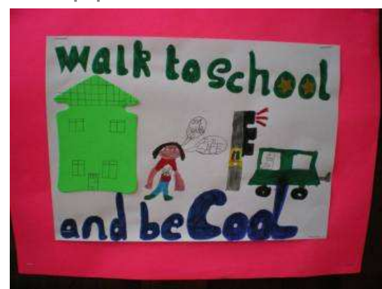
Figure 10 Poster designed by St Joseph's RC PS pupil

It is estimated that we engaged with approximately 130 pupils through a variety of different ways at the transition events.