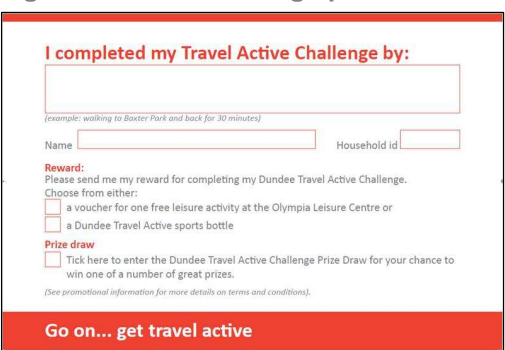
Figure 6 Active challenge postcard