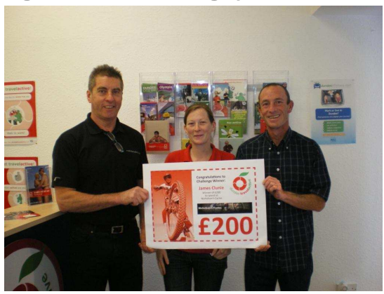
Figure 8 Active challenge prize draw winner

Across the two years of the project, 1,645 active challenges were issued, equating to just under half of all participants agreeing to undertake a challenge. Walking and 5x30 challenges were the most frequently issued.