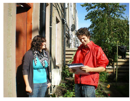
Figure 5 Doorstep conversation with West End resident