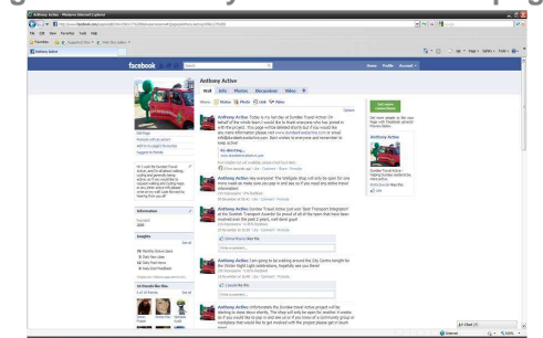
Figure 14 Anthony Active Facebook page