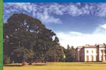
Historic Camperdown House overlooks the course