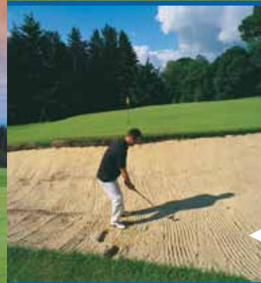
The approach to Caird Park’s tree-lined 16th