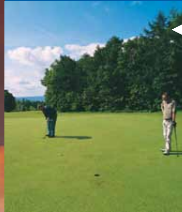
On target at the 2nd green at Camperdown

In addition to golf, the 735 acre park boasts something for all the family. There is the award-winning Camperdown Wildlife Centre, an extensive children’s play area, a Countryside Ranger Service and events programme, seasonal cycle centre, tennis, seasonal boating, pitch and putt and a refreshment kiosk.