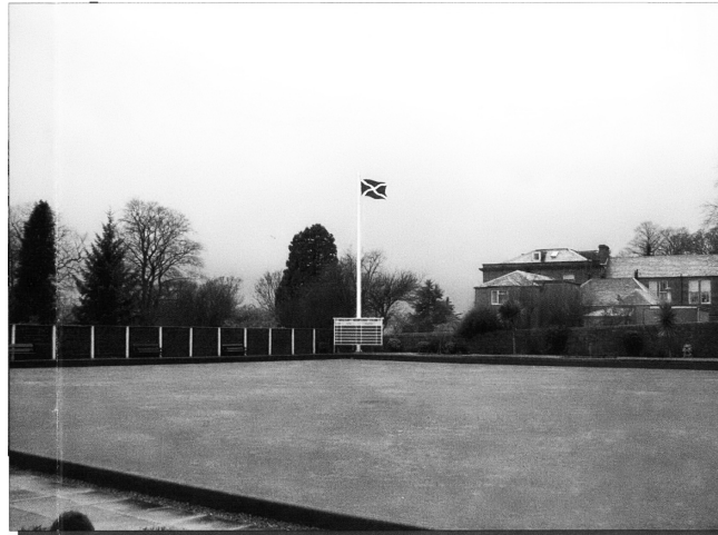
This Photomontage shows as proposed