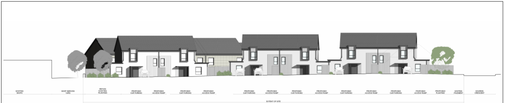
Figure 3 – Site 3 – Proposed Street Elevation - Gourdie Place