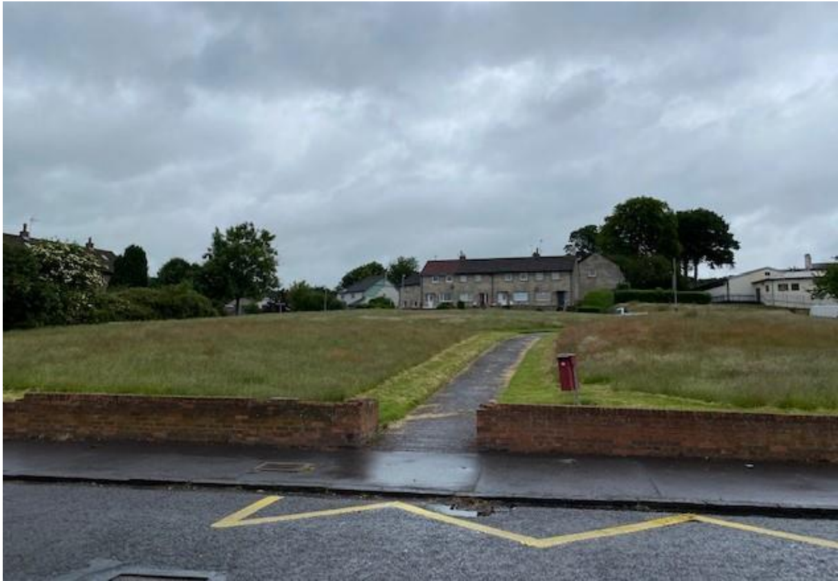
Figure 6 – Site 3 Photo