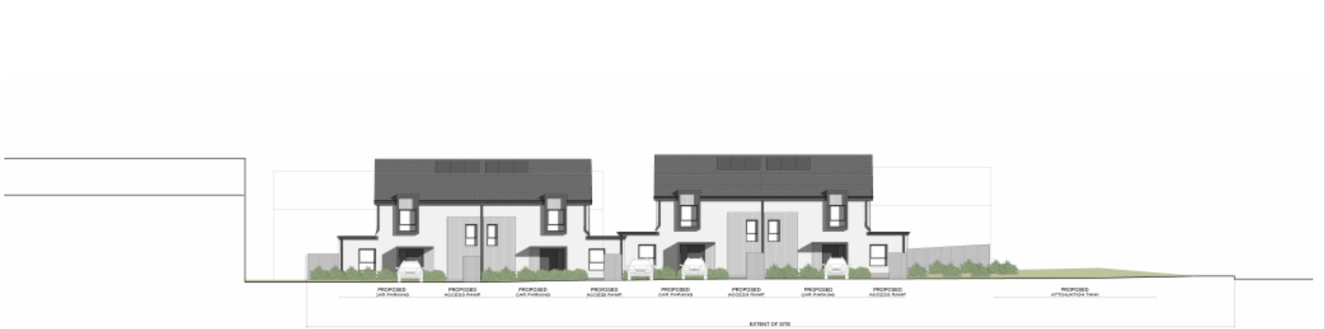
Figure 5 - Site 4 – Proposed Street Elevation - Invercraig Place