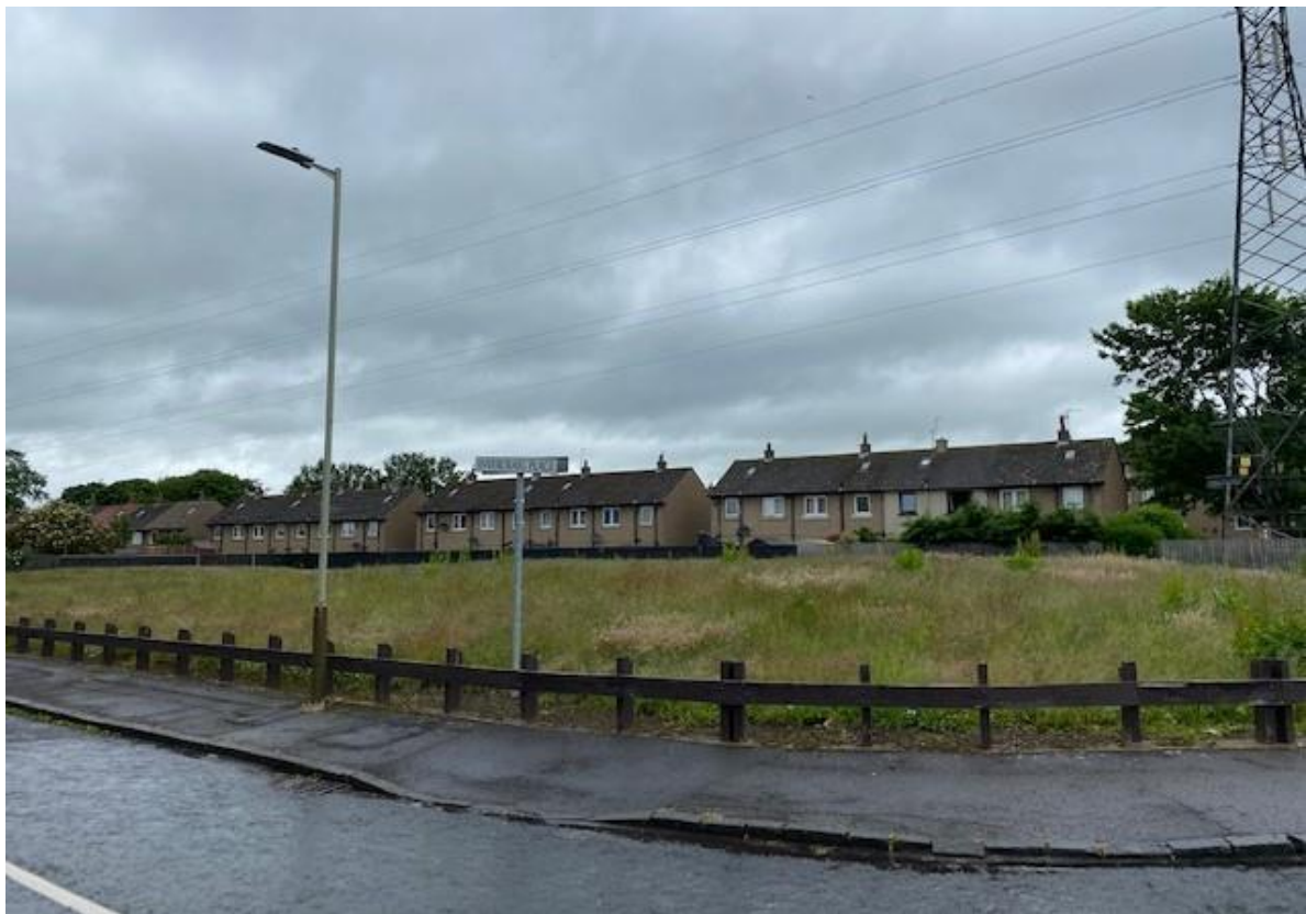
Figure 7 – Site 4 Photo