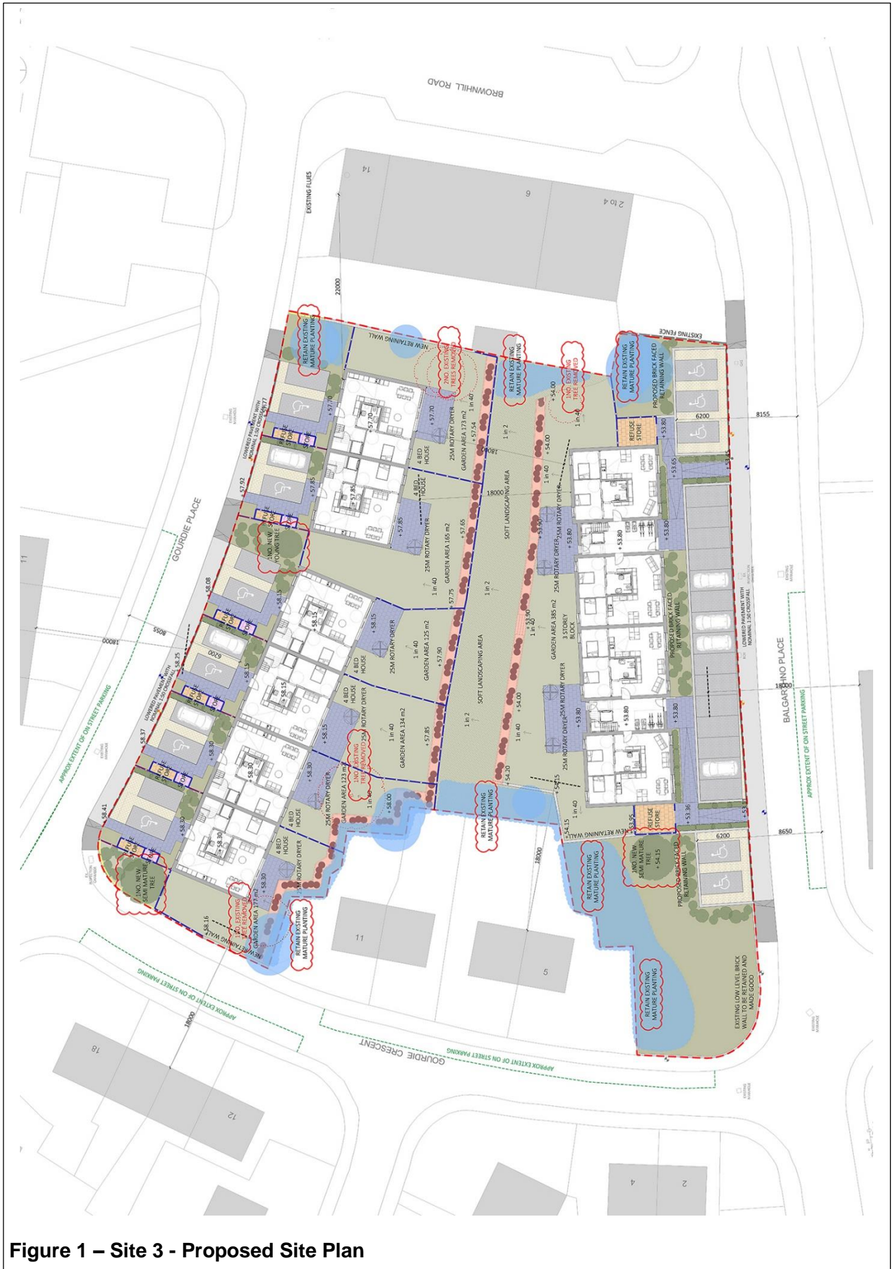
Figure 1 – Site 3 - Proposed Site Plan