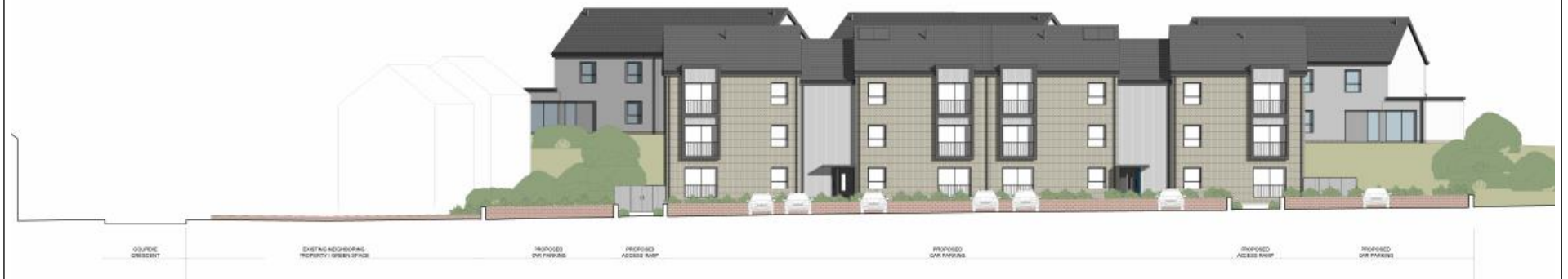
Figure 4 - Site 3 – Proposed Street Elevation - Balgarthno Road