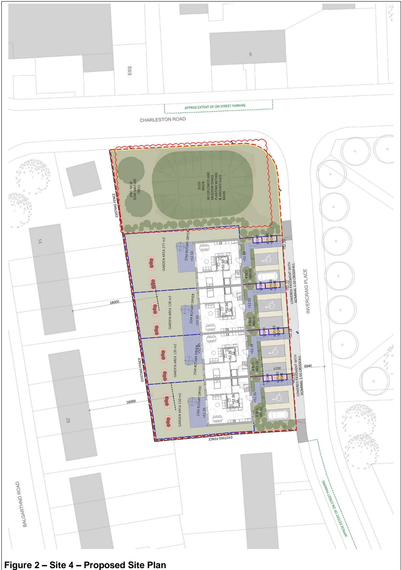
Figure 2 – Site 4 – Proposed Site Plan