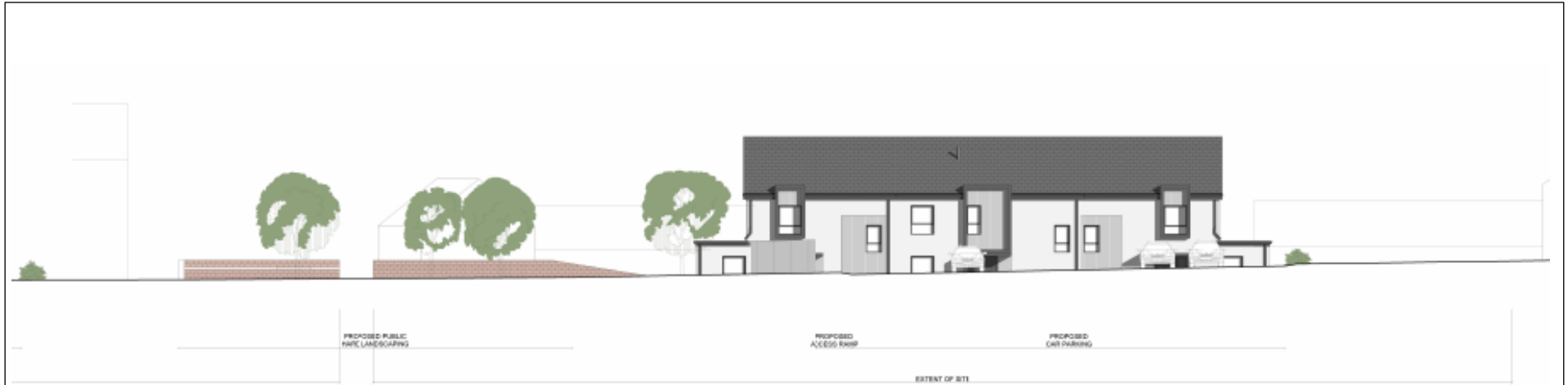
Figure 3: Site 5 - Proposed Street Elevation - Buttar's Road