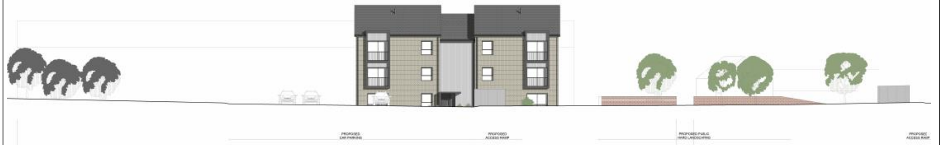
Figure 4: Site 6 - Proposed Street Elevation - Buttar's Road