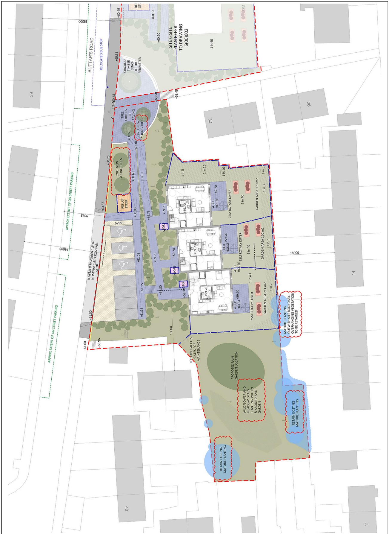
Figure 1: Site 5 - Proposed Site Plan