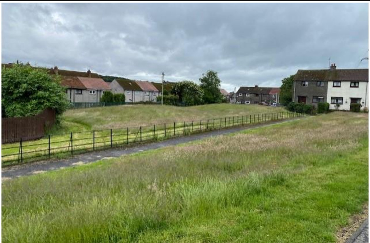
Figure 5 – Site 5 Photo