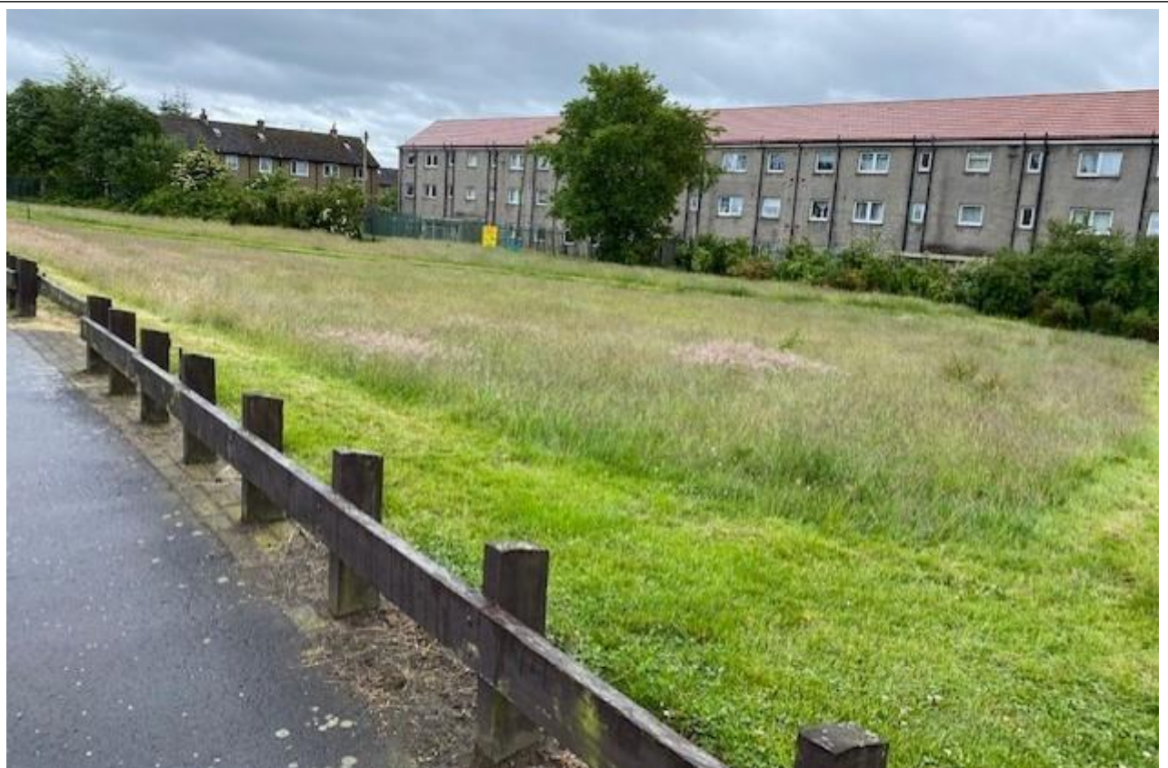
Figure 6 – Site 6 Photo