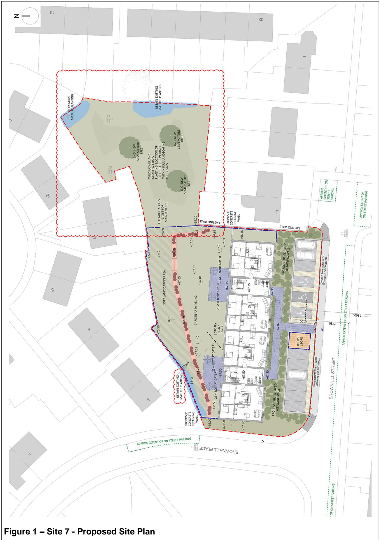
Figure 1 – Site 7 - Proposed Site Plan