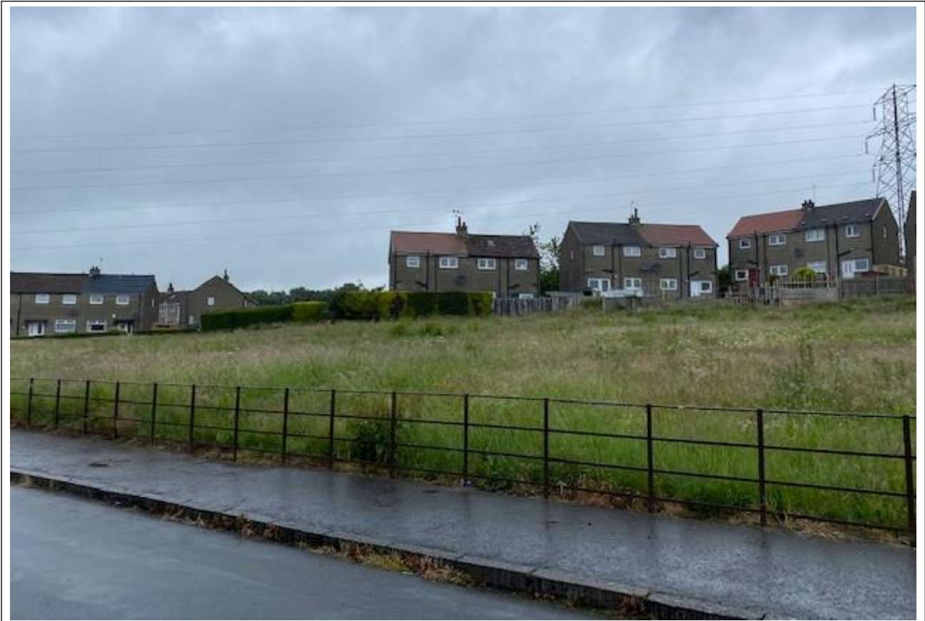
Figure 3 – Site 7 Photo