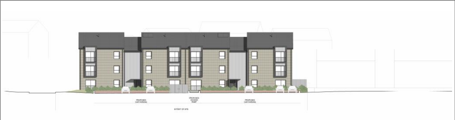
Figure 2 – Site 7 – Proposed Street Elevation - Brownhill Street