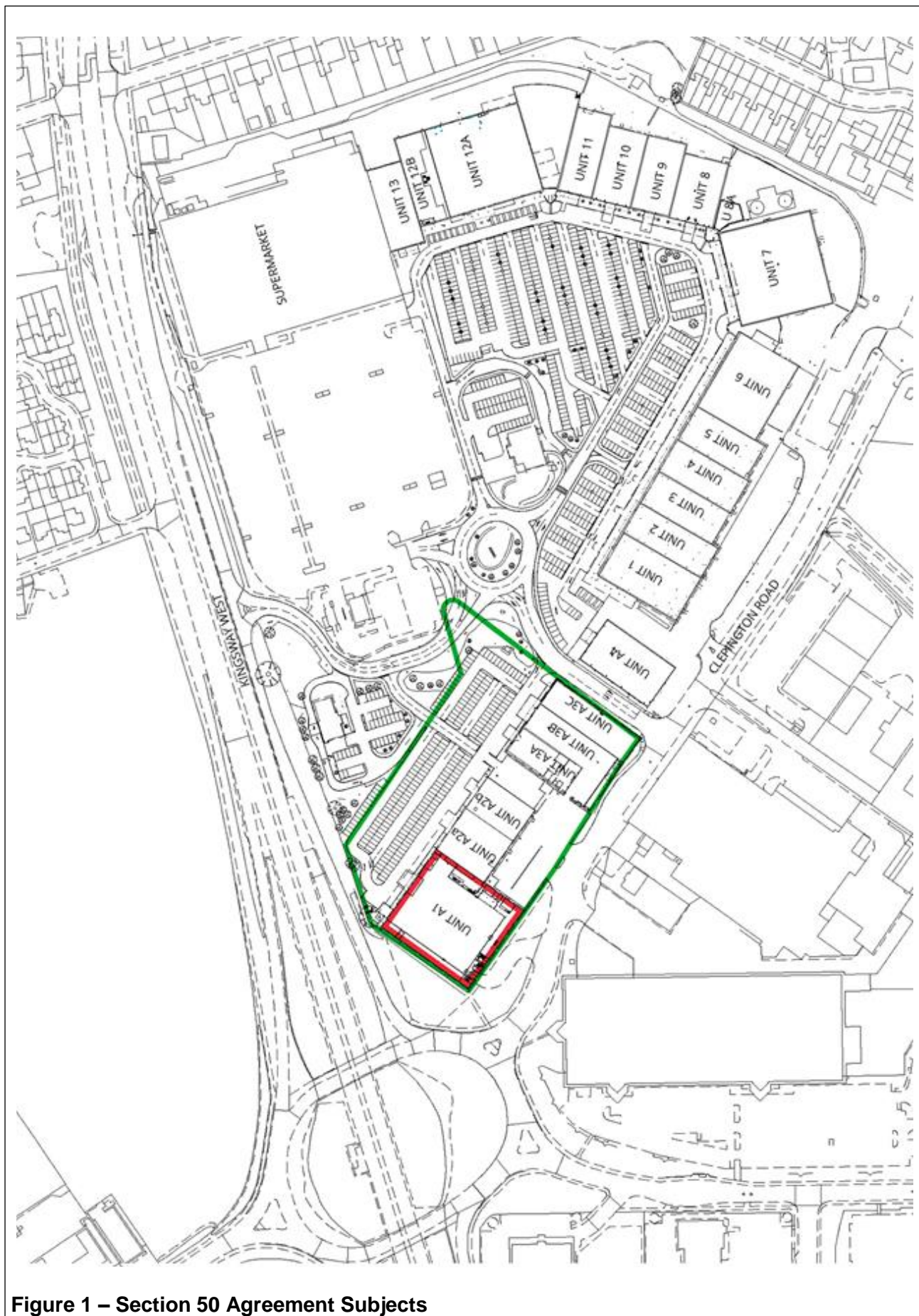
Figure 1 – Section 50 Agreement Subjects