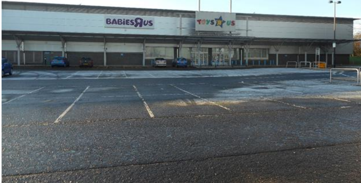
Figure 2 – Photo of Unit A1