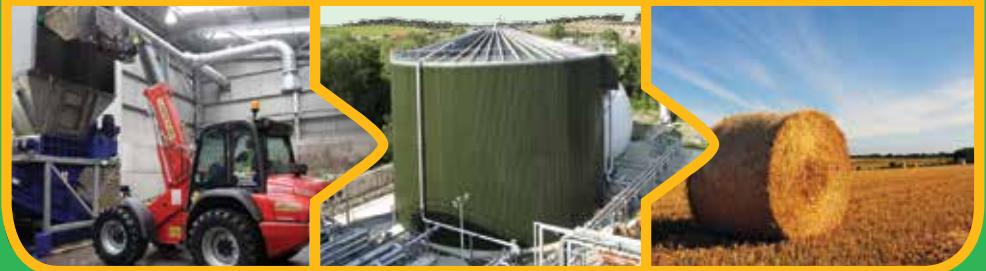
Information kindly provided by Scottish Water Horizons

Your food waste is taken to a special processing plant where it is recycled and turned into valuable resources such as agricultural fertiliser and energy.