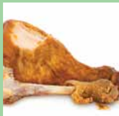
Meat and bones ✓