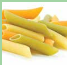
Rice and pasta ✓