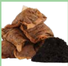
Tea bags and coffee grounds ✓

Your new food waste recycling service will be able to be used for ALL cooked ✓ and uncooked ✓ food waste, it will even take bones!