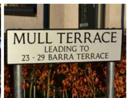
A 'Gaelic Village' existed in the Claverhouse and Mill O' Mains area, a link retained by street names in the area