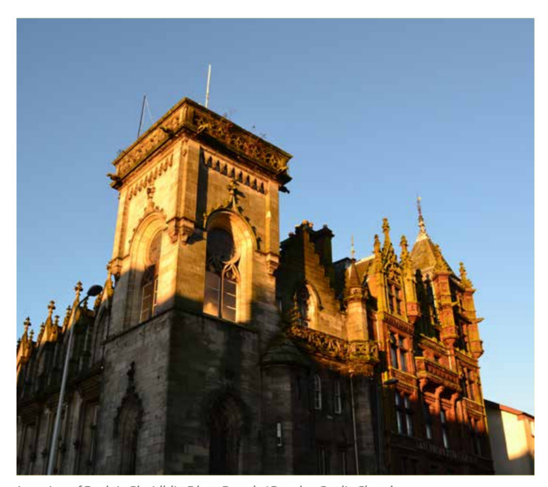
Location of Eaglais Ghaidhlig Dhun Deagh / Dundee Gaelic Church

Dundee City Council will compile an annual progress report that will be provided to Bòrd na Gàidhlig and made available to the public.