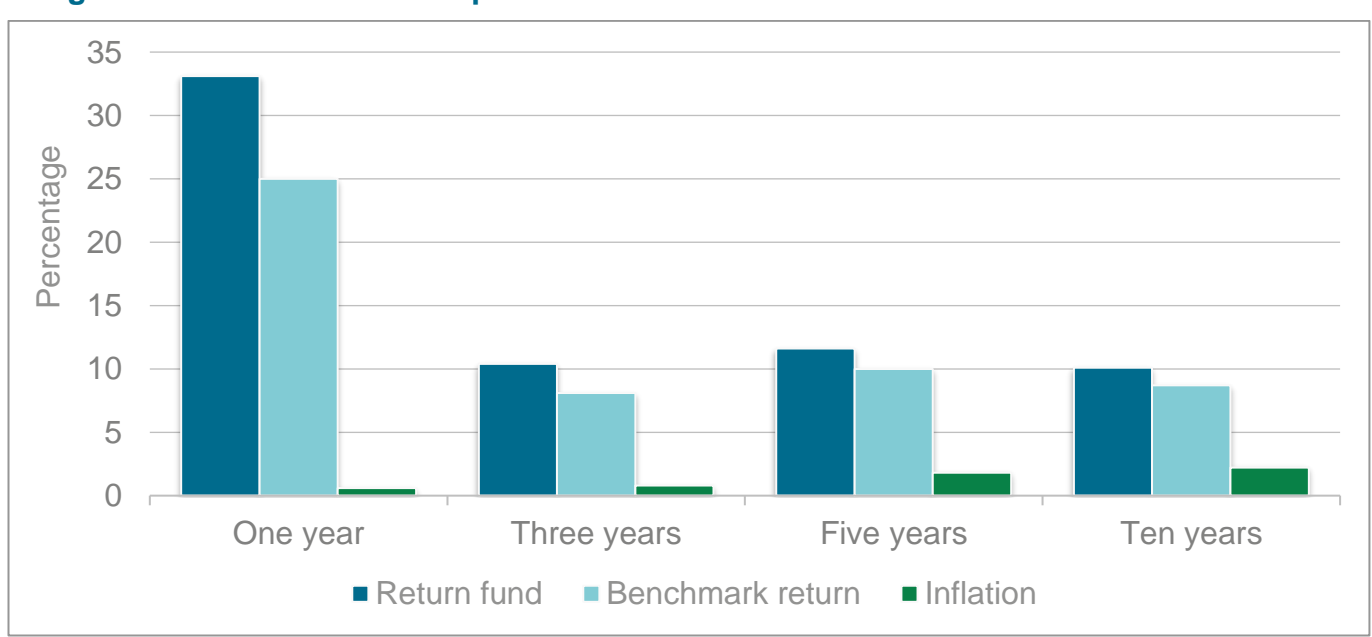
Exhibit 6 Longer-term Fund investment performance