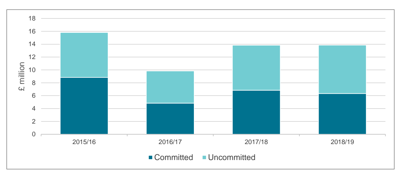
Exhibit 7 Analysis of general fund over last four years