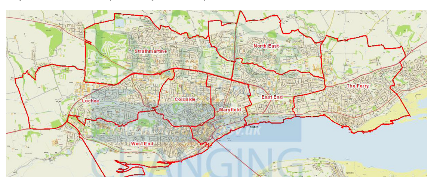
Map 2. Local Community Planning Partnership Areas

The following information identifies the eight Local Community Planning Partnership Areas where potential new housing developments throughout the City may be developed over the next 5 to 30 years.