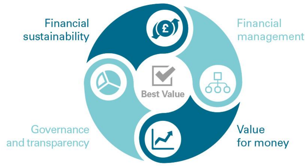
Exhibit 1 Audit dimensions