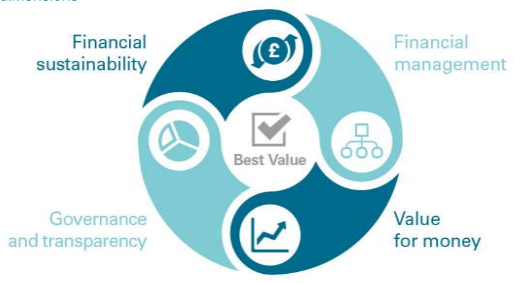
Exhibit 5 Audit dimensions

25. Our audit is based on four audit dimensions that frame the wider scope of public sector audit requirements as shown in Exhibit 5.