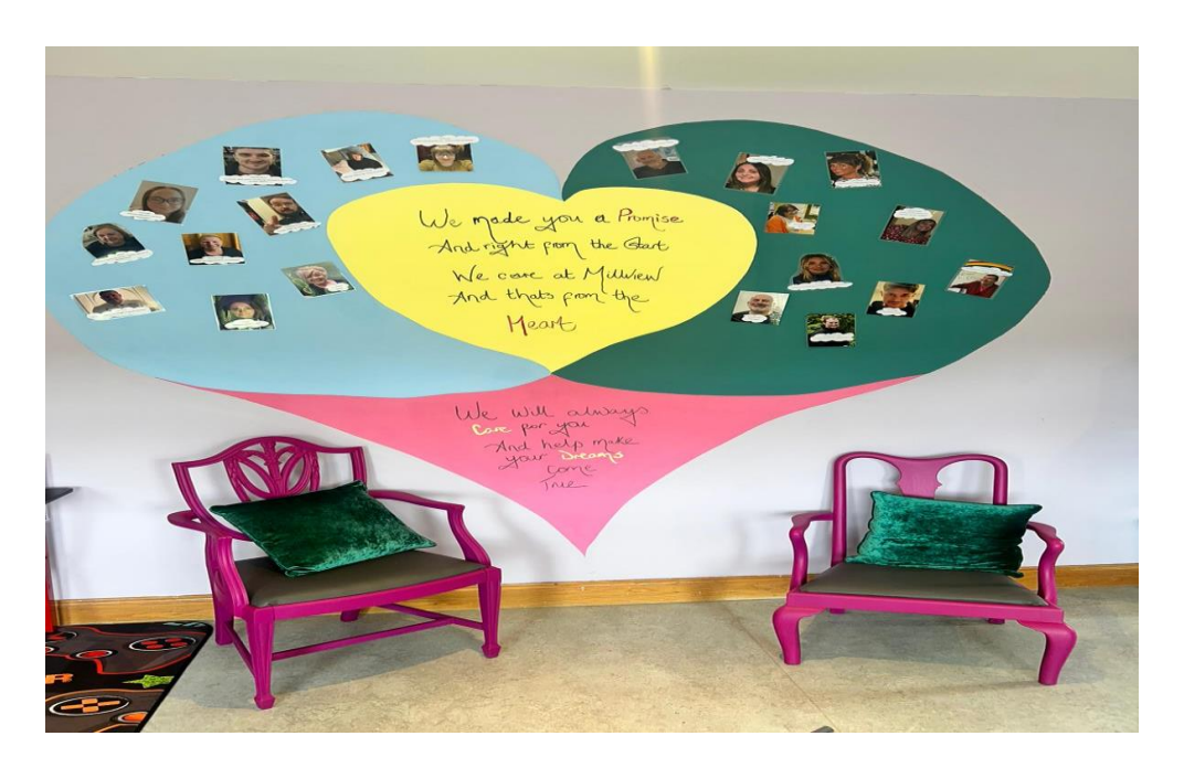
Millview Cottage, commitment to 'The Promise'

At Fairbairn House, the team was not inspected but they have now moved to the newly opened Craigie Cottage, which will support a younger group of children aged 6 to 12 years. The accommodation at Fairbairn House is also being retained and re-provisioned as a supported housing facility for young people seeking to leave care and requiring structured support.