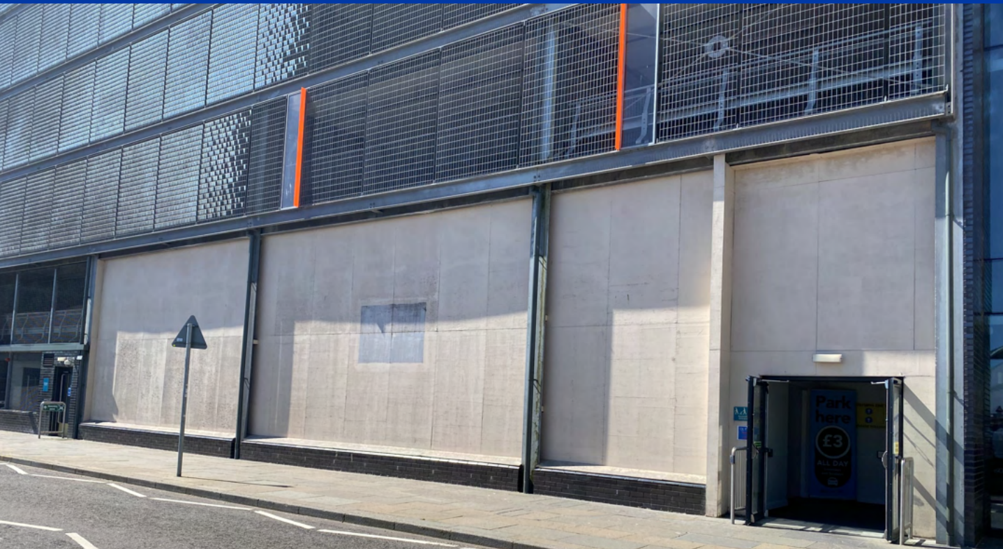
East elevation overlook Gallagher Retail Park

DUNDEE IS IN THE MIDST OF A £1BILLION REDEVELOPMENT OF ITS WATERFRONT.