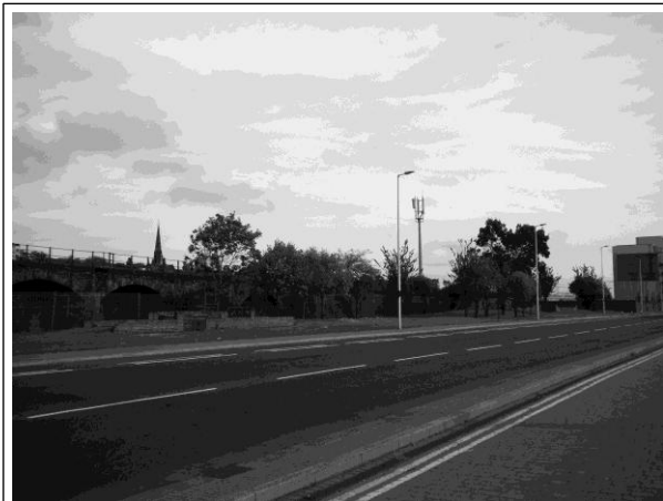
Figure 2 – Photograph Looking East Along Riverside Drive

4.1 Planning application ref: 05/00770/FUL sought permission for the erection of 202 apartments and provision of 239 car parking spaces at the site of the former Homebase Store on Riverside Drive. This application was approved by the Development Management Committee subject to conditions.