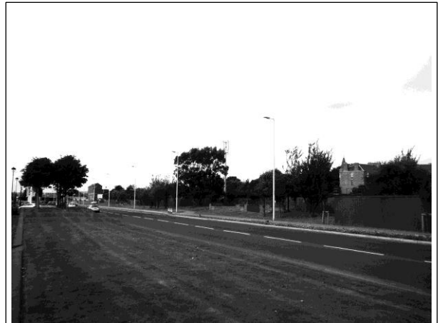
Figure 3 – Photograph Looking West Along Riverside Drive