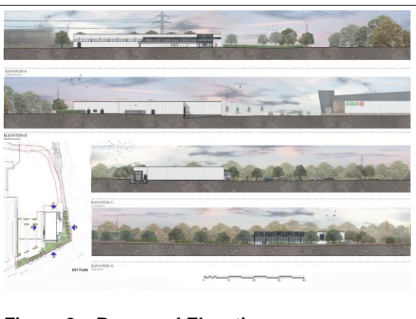
Figure 2 – Proposed Elevation

allow the construction of an Aldi store on the site in a shorter timescale than might be the case with the extant permission that is subject to the legal challenge.