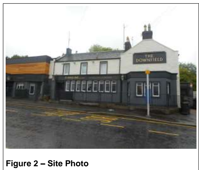
Figure 2 – Site Photo

2.1 The application site measures 2,650m 2 and relates to the existing public house and restaurant, known as the Downfield, at 530 Strathmartine Road, to the north of the Kingsway. More specifically, the application refers to "DOCS deli", a takeaway area within the premises. The site is not located within a District Centre as per the adopted Dundee Local Development Plan, 2014. Surrounding adjacent land uses are residential and commercial, with sheltered housing located to the immediate north of the application site.