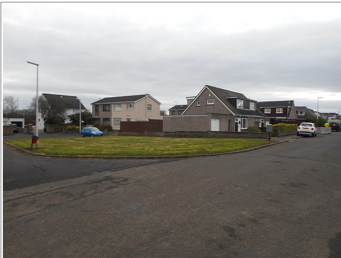
Figure 3 – Site Photo