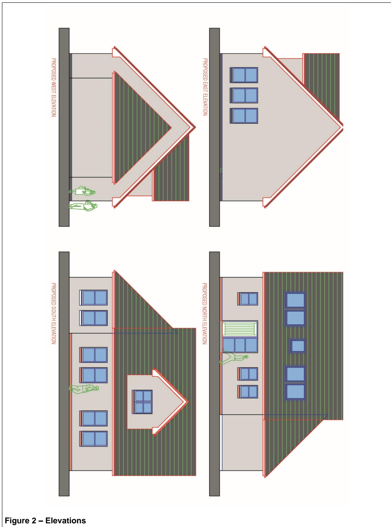
Figure 2 – Elevations