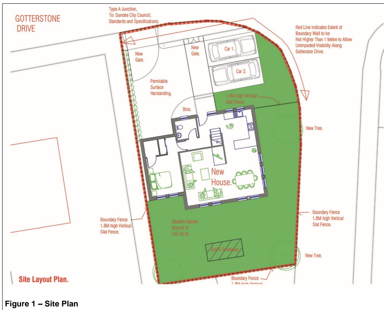
Figure 1 – Site Plan