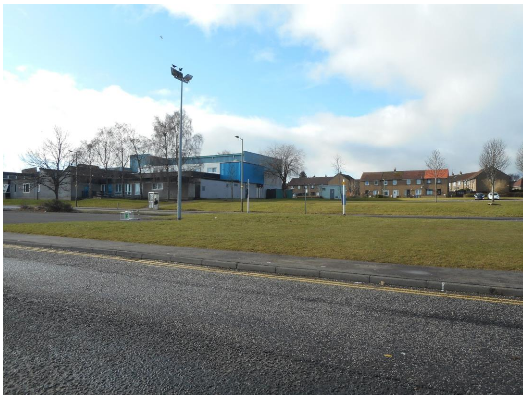
Figure 3 – Site Photo