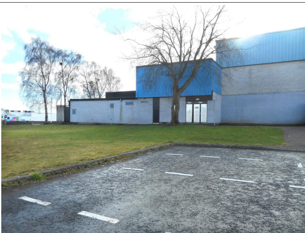
Figure 2 – Site Photo