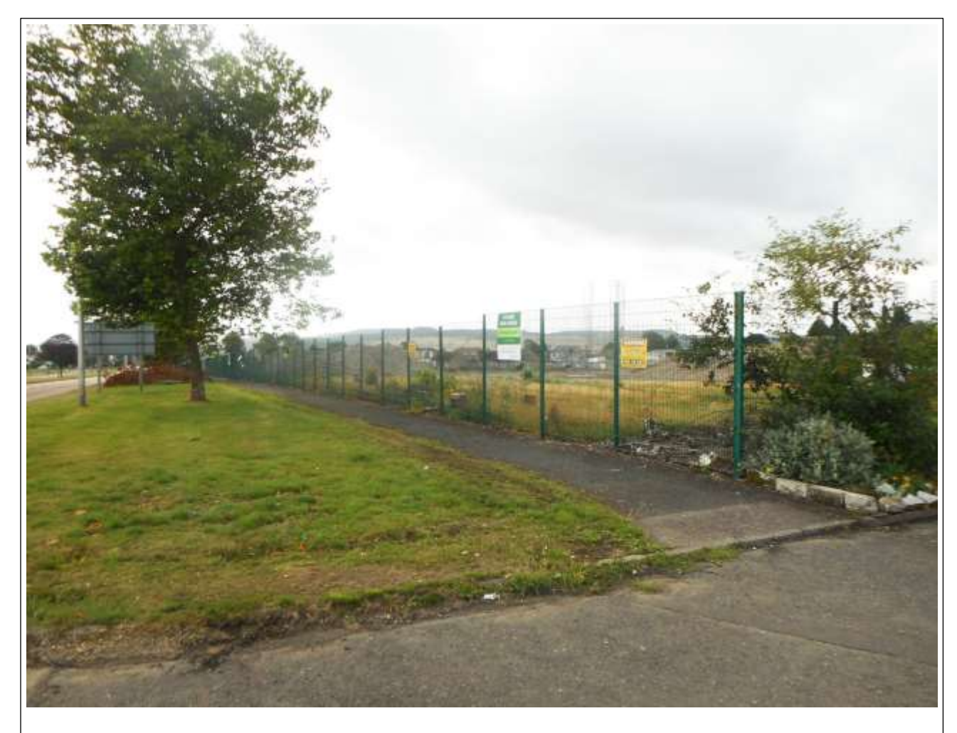
Figure 2 – Site Photograph