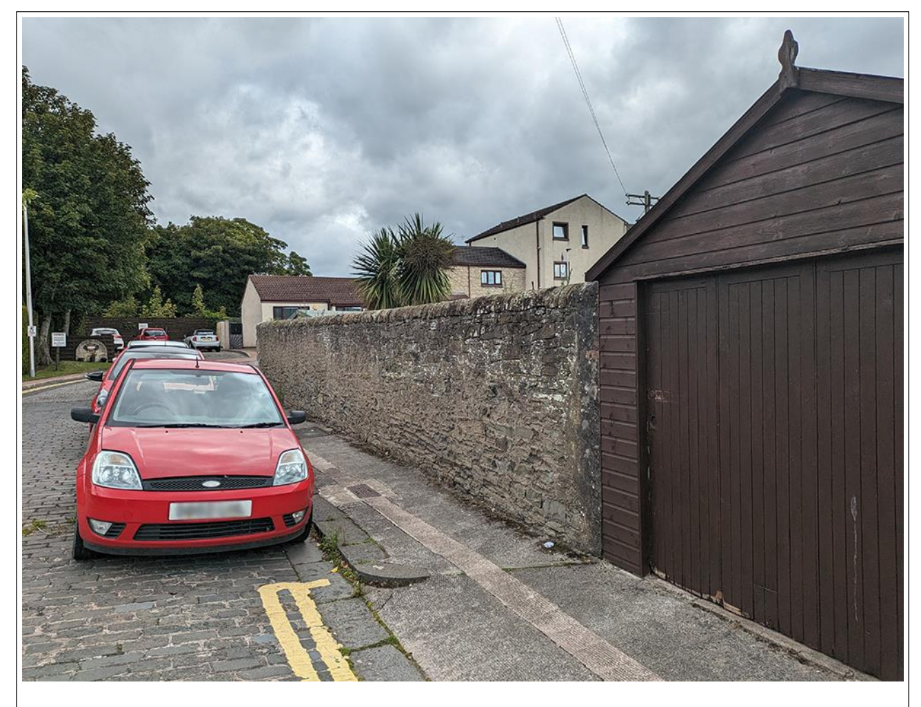
Figure 2 – Location of Proposed Sliding Gate