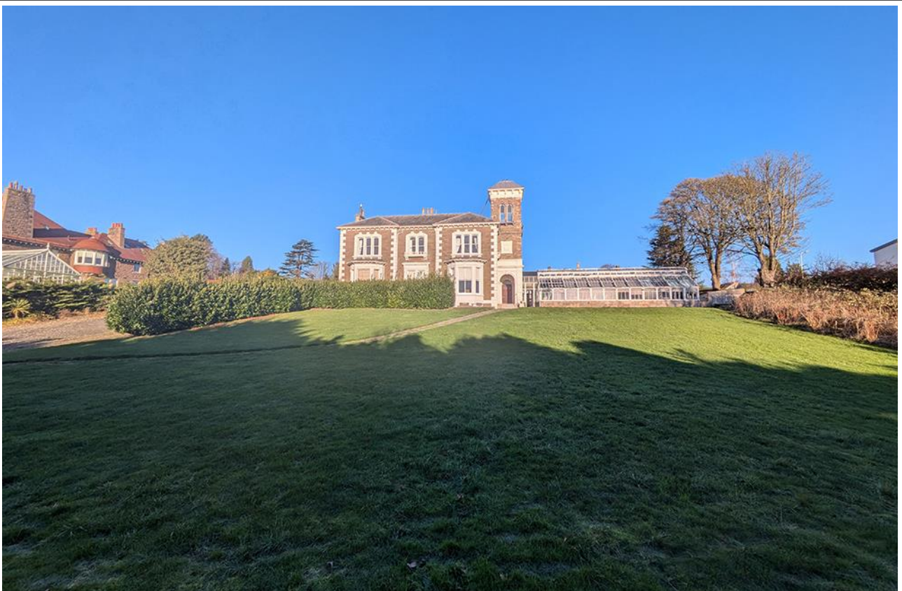
Figure 5 – Broomhall House and Garden