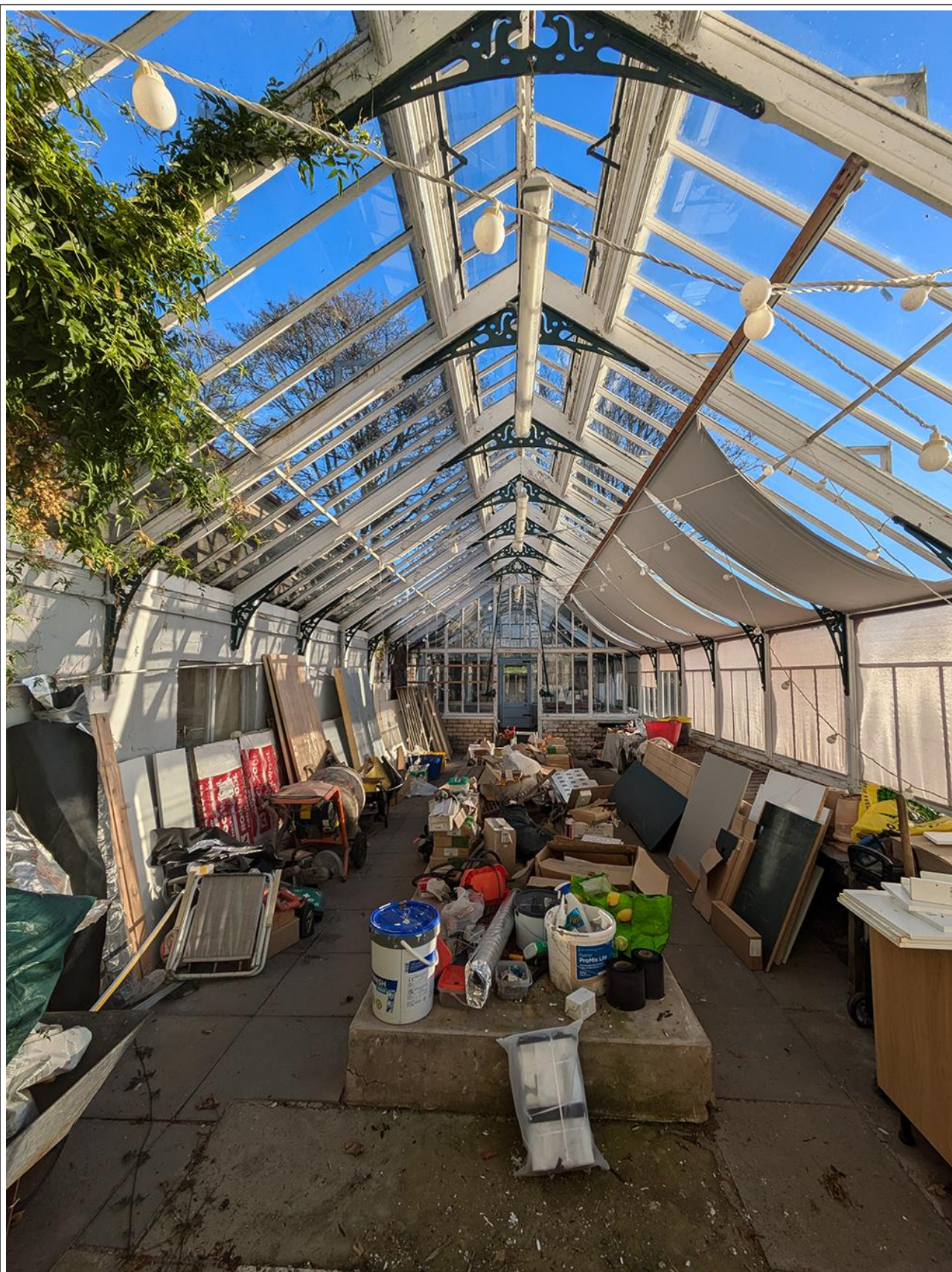
Figure 7 – Conservatory