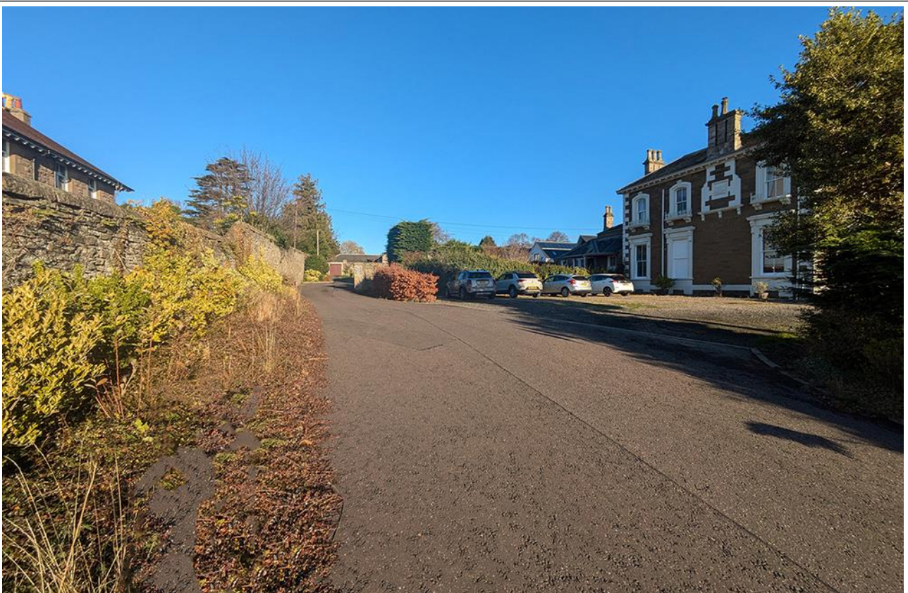
Figure 6 – Shared Driveway and Western Elevation