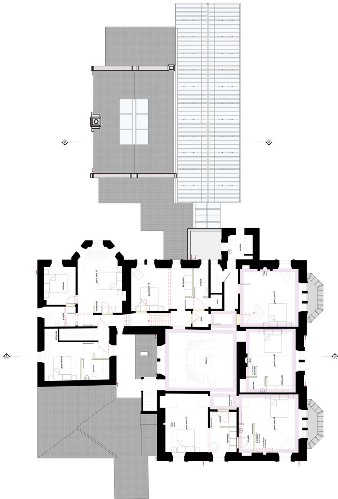
Figure 4 – Proposed First Floor Plan