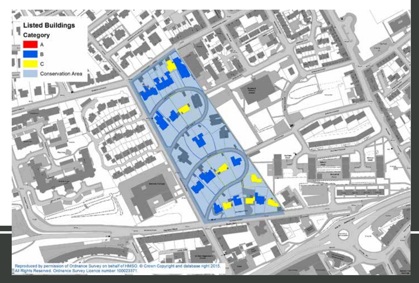
Figure 3 - Listed Buildings

See Figure 3 which indicates the location of Listed Buildings within the Crescents Conservation Area.