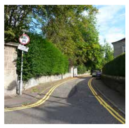
Winding narrow roads are the result of the elliptical crescent shaped street layout