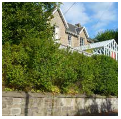
Villas in substantial grounds with high level or urban greenery