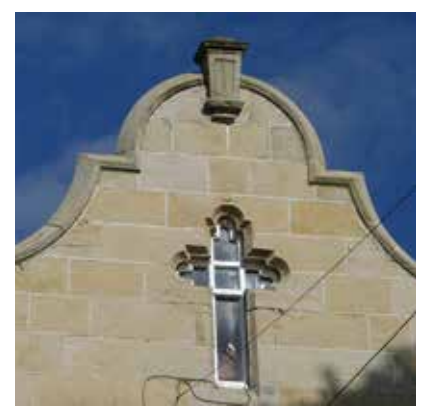
Architectural detailing adds to the character of the Crescents Conservation Area

A Conservation Area is dynamic and constantly evolving and therefore it is essential to review and analyse its character. The purpose of a conservation area appraisal is to define what is important about the areas' character and appearance in order to identify its important characteristics and special features.