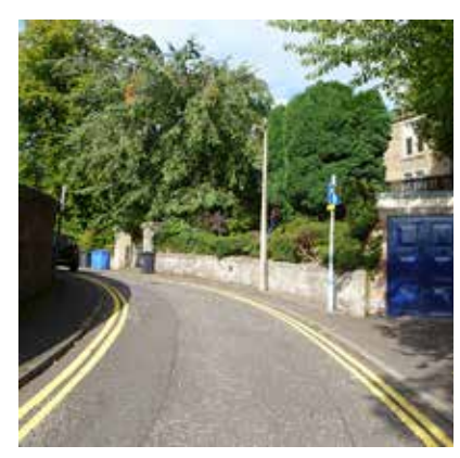
The winding street pattern is a main character contribution to the area

The street pattern of the Crescents Conservation Area is a key contributor to its overall character. It is therefore essential that any development which involves any alteration to this layout is strongly discouraged to help retain the original streetscape.