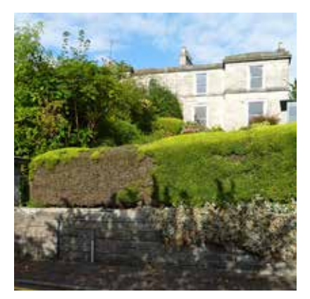
Boundary walls and trees help to define distinct character

In a Conservation Area it is the buildings and the spaces between them that are of architectural or historic relevance, which along with a number of additional factors; contribute to the individual personality of each designation. The purpose of a Conservation Area is to ensure that new development or alterations will not negatively impact on the existing character of an area. Conservation Area status does not mean that new development or alterations are not acceptable; in actual fact; the designation is used as a management tool for future developments. This tool can be used to guide the production of high design quality and to ensure the preservation or enhancement of the special character and appearance of the area.