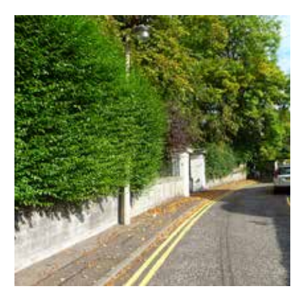
Mature trees create a sense of privacy and enclosure

Trees make up a key component of the character of the Crescents Conservation Area where mature trees collectively make a significant contribution to the overall look of the area.