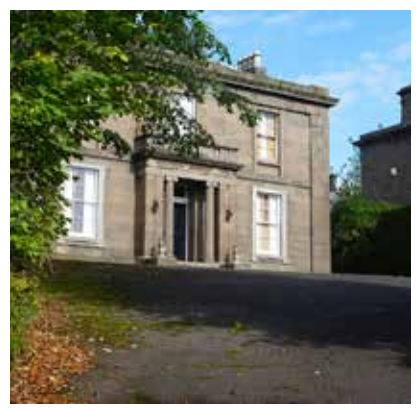
The majority of villas within the conservation area are listed by Historic Scotland

Crescents Conservation Area contains a number of buildings which are listed by Historic Scotland for their special architectural or historic interest. A building's listing covers its interior, exterior and 'any object or structure fixed to a building' or which falls within the curtilage of such a building, forming part of the land since before 1 July 1948. The alteration or removal of any feature or fixtures requires listed building consent.