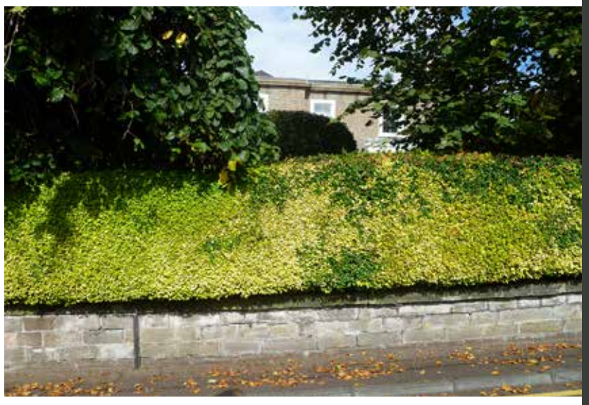
Some properties are barely visible through screens of greenery

There are a number of examples of original gas lamp fixtures located within the Conservation Area, some of which are in a poor state of disrepair. There are also examples of historic street signs. The conservation area contains a post-box recessed into the wall of number 77 Constitution Road. There is a historic red phone box located on Dudhope Place, which is also a listed structure.