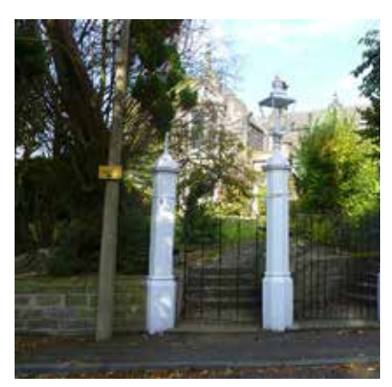
Only glimpses can be seen of some of the large properties

Located on the steep slopes of Dundee Law to the immediate north of the City Centre, the Crescents is one of Dundee's smaller Conservation Areas. It comprises the two elliptical crescents of Constitution Terrace/Union Terrace and Prospect Place/Laurel Bank, and Dudhope Place, leading off Constitution Road. The houses are a mixture of large detached villas and semi detached villas, with attractive mature gardens, set in the terraces formed by the Crescents. They are complemented by original boundary walls, railings, the odd early street sign, and several gas lamp brackets over gateways. A number of the properties have been subdivided into flatted properties.