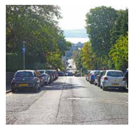
Impressive view towards the Tay by looking down Constitution Road

The layout of the buildings in the Conservation Area maximise views from the individual buildings over Dundee City, the River Tay and further to Fife. The dominant views from within the Conservation Area are of mature trees and stone boundary walls which provide distinct character to the area. The street pattern also contributes to the area's character as the narrow curved streets restrict views out of the conservation area.