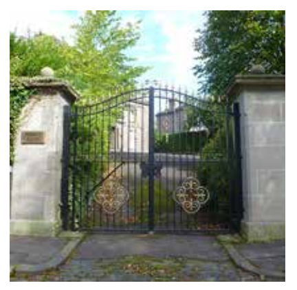
Traditional gate piers and gates