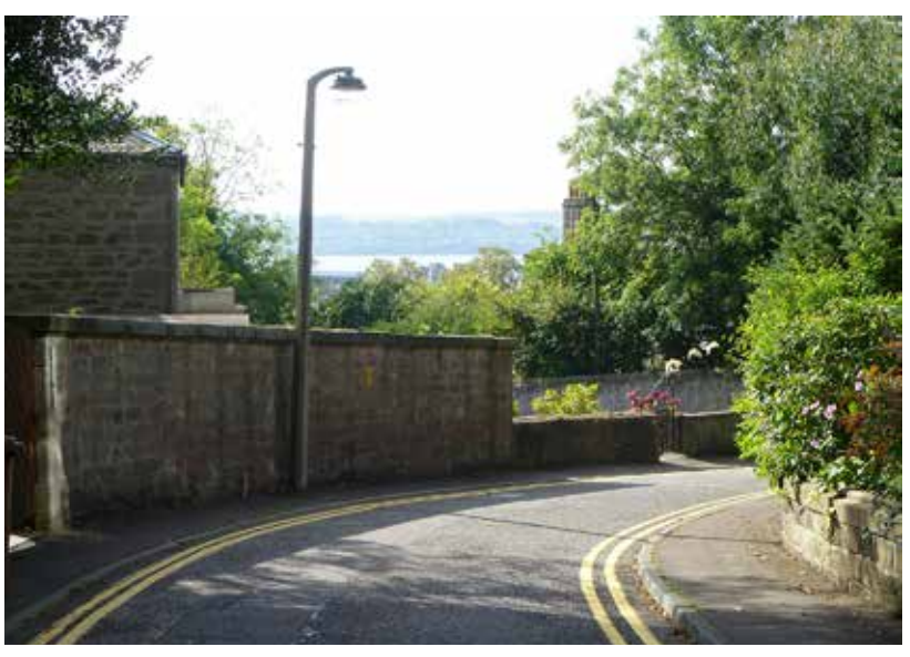
Narrow steep roads wind up the Law providing great views of Dundee, the Tay and further over to Fife

The street pattern of the Crescents Conservation Area is dominated by the 'horseshoe' layout of its streets which create distinct character. The winding nature of the roads allow the properties to take advantage of the views over Dundee and the Tay, in doing so working with the steep topography of the Law Hill.