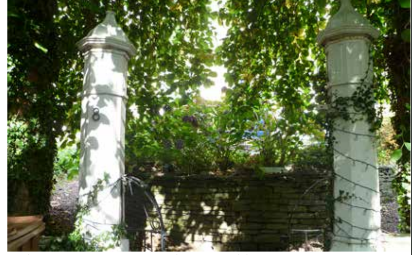
Columns at entrances and screened by greenery

"The Crescents Conservation Area is characterised by its large impressive villas situated within defined horse-shoe shaped crescents"