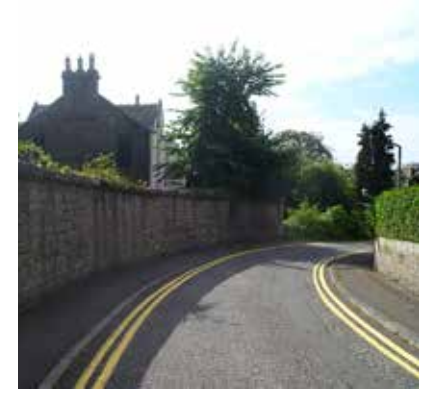
Boundary walls are an important feature of the area

The character and appearance are both key elements to be considered when appraising a Conservation Area. Crescents Conservation Area has been identified as having particular aspects of historic or architectural interest which are important to the area's character, and are important to preserve and enhance. This section shall analyse the main elements that contribute to the character and appearance of the Crescents Conservation Area whilst establishing its value within the wider context of Dundee.