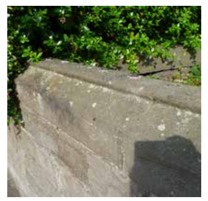
Iron work has been removed in some cases