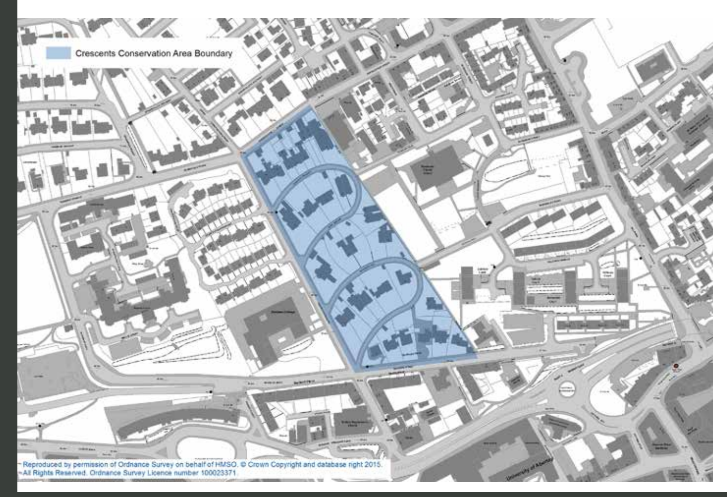
Figure 1 – Current Conservation Area Boundary

At present the perimeter of the Conservation Area is fitting and appropriate to purpose. There are no amendments to the boundary identified at this time.