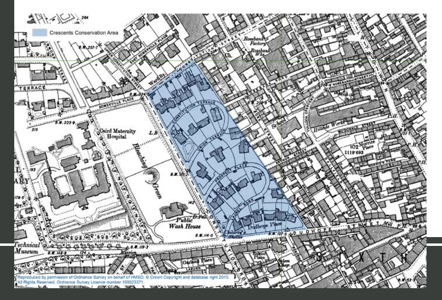
Figure 2 - 1902 Historic Map

Many of the houses have since been extended and sub-divided into flats but the essential character of this early Victorian residential suburb of the city is worthy of being preserved, enhanced and protected.