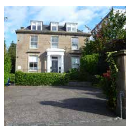
Traditional property within the Crescents Conservation Area

A Conservation Area is defined by the Scottish Government, within Section 61 of the Planning (Listed Buildings and Conservation Areas) (Scotland) Act 1997 as; "An area of special architectural or historic interest, the character or appearance of which it is desirable to preserve or enhance."