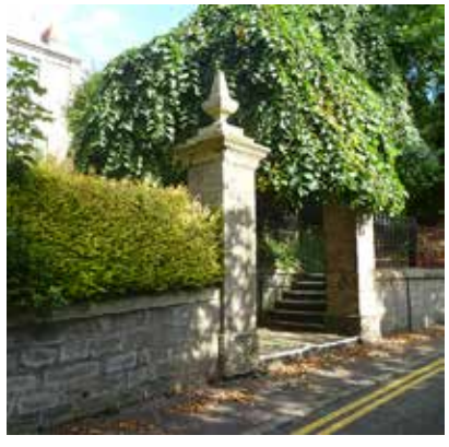
Hedges form part of boundary walls as well as the presence of mature trees