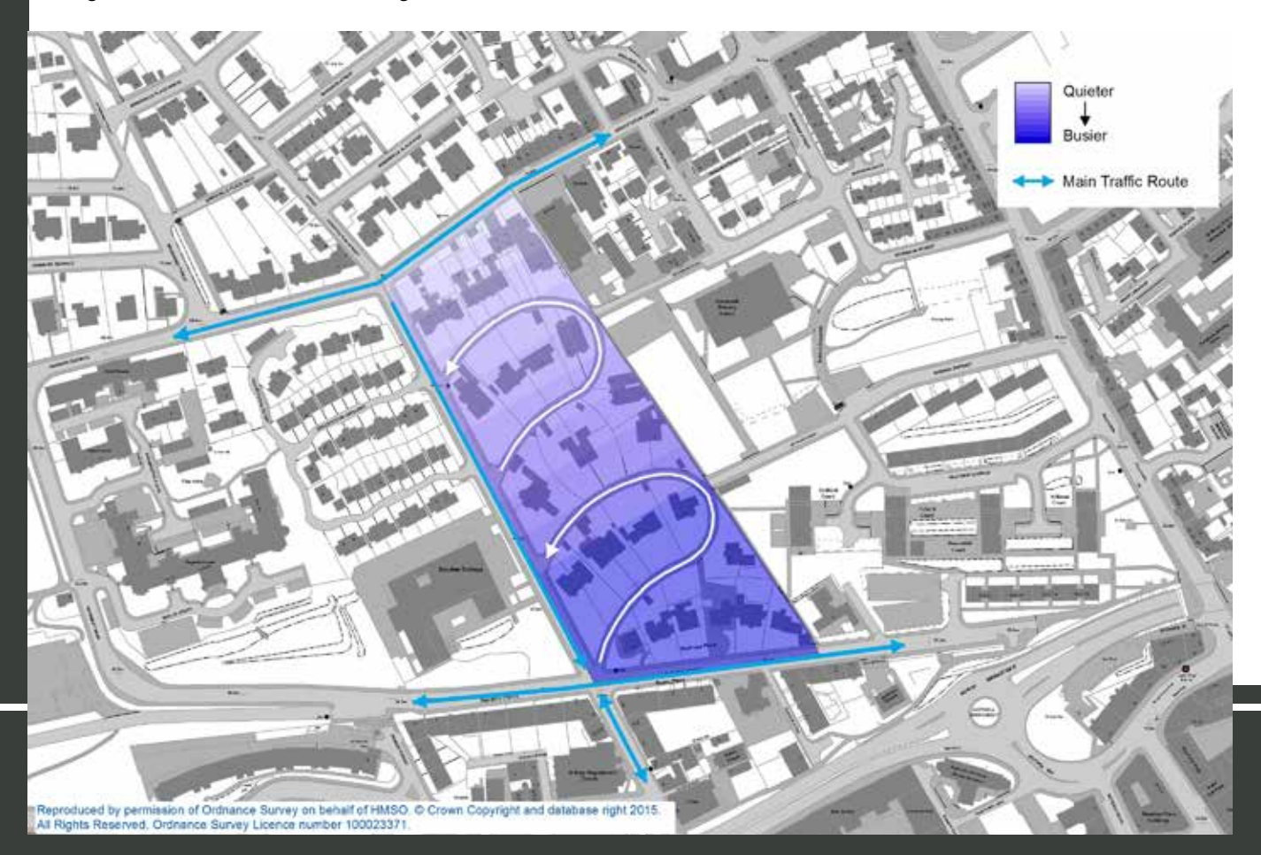
Figure 4 - Movement & Activity

The vehicular traffic in the conservation area is managed in a variety of ways. The traffic which accesses Constitution Road is controlled using a one way system allowing vehicular movement from north to south. The two horse-shoe shaped crescents, Constitution Terrace/ Union Terrace and Prospect Place/ Laurel Bank, as well as Dudhope Place are also controlled using a one way system. Parking provision is an issue within the Conservation Area due to its close proximity to Dundee city centre and to the Constitution Road former campus of Dundee College. Along Dudhope Street parking is managed using a pay and display system, however on other streets double yellow lines seem to be ineffective in discouraging parking.