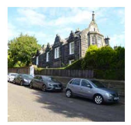
Elevated levels of urban greenery creates privacy and also adds character

Located on the steep slopes of Dundee Law to the immediate north of the City Centre, the Crescents is one of Dundee's smaller Conservation Areas. It comprises the two elliptical crescents of Constitution Terrace/Union Terrace and Prospect Place/Laurel Bank, and Dudhope Place, leading off Constitution Road. The houses are a mixture of large detached villas and semi detached villas, with attractive mature gardens, set in the terraces formed by the Crescents. They are complemented by original boundary walls, railings, the odd early street sign, and several gas lamp brackets over gateways. A number of the properties have been subdivided into flatted properties.