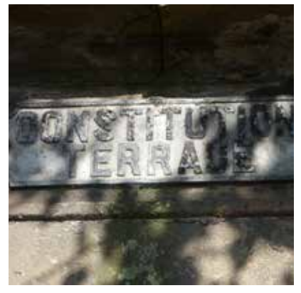
Original street sign for Constitution Terrace