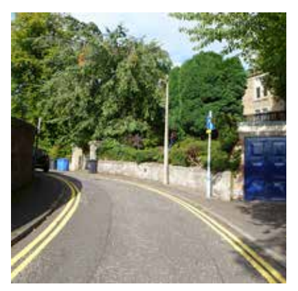
The narrow streets of the conservation area are controlled via a one way system

The vehicular traffic in the conservation area is managed in a variety of ways. The traffic which accesses Constitution Road is controlled using a one way system allowing vehicular movement from north to south. The two horse-shoe shaped crescents, Constitution Terrace/ Union Terrace and Prospect Place/ Laurel Bank, as well as Dudhope Place are also controlled using a one way system. Parking provision is an issue within the Conservation Area due to its close proximity to Dundee city centre and to the Constitution Road former campus of Dundee College. Along Dudhope Street parking is managed using a pay and display system, however on other streets double yellow lines seem to be ineffective in discouraging parking.