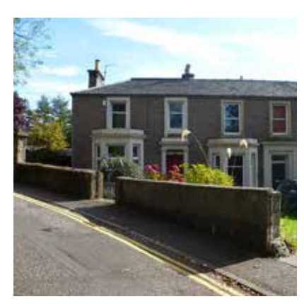
Presence of semi-detached properties as well as large villas