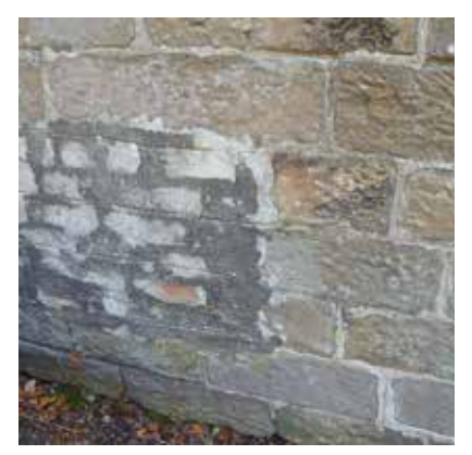
Insensitive wall repair

Crescents Conservation Area retains a private feel, characterised by its stone boundary walls and mature trees. Many of the properties remain partially hidden from public view. Boundary walls are a very important feature of the Conservation Area; however there is evidence of poor repair work. The repointing of boundary walls must be carried out using an appropriate lime based mortar which shall closely match the characteristics of the original. Alterations shall be required to be in accordance with the guidance established by Historic Scotland and Dundee City Council's '<u>BREACHES</u> IN BOUNDARY WALLS Policy and Guidance for Dundee's Listed Buildings and Conservation Areas.'