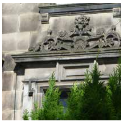
Architectural detailing adds to the character of the overall area

The land use of the Conservation Area is mainly residential; however there are a number of commercial uses located along Dudhope Place where these are generally office based. The impact of this change of use has been minimal in terms of the effect on the building's exterior.