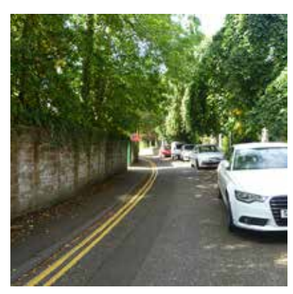
Roads bounded on either side by high boundary walls and greenery

The predominately residential buildings are characterised with traditional slate roofs, boundary walls and mature trees. Within the Conservation Area there are many unique villas where the properties are characterised by their entrances detailed with columns, capitals, iron balustrades and quoins.