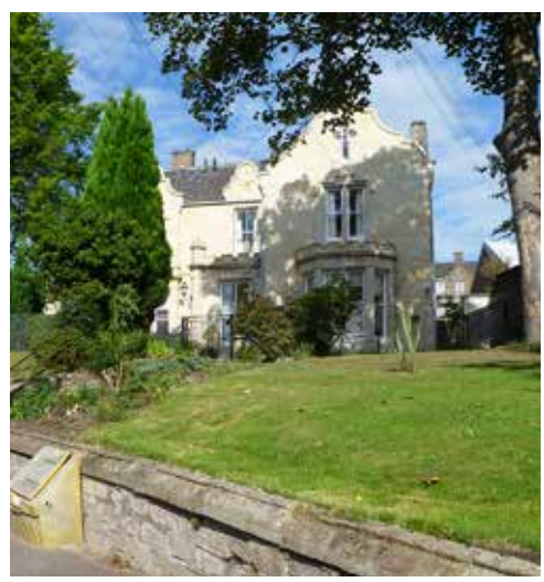
Large garden grounds to the front and rear of properties

The Crescents Conservation Area is characterised by its large impressive villas situated within defined horse-shoe shaped crescents. The properties are enclosed by high stone boundary walls or lower walls supported by tall hedges. The roads within the Conservation Area are narrow and are bounded by these walls therefore emphasising a sense of enclosure. The boundary walls of the Crescents Conservation Area remain one of its most important assets adding value and character to the area overall.