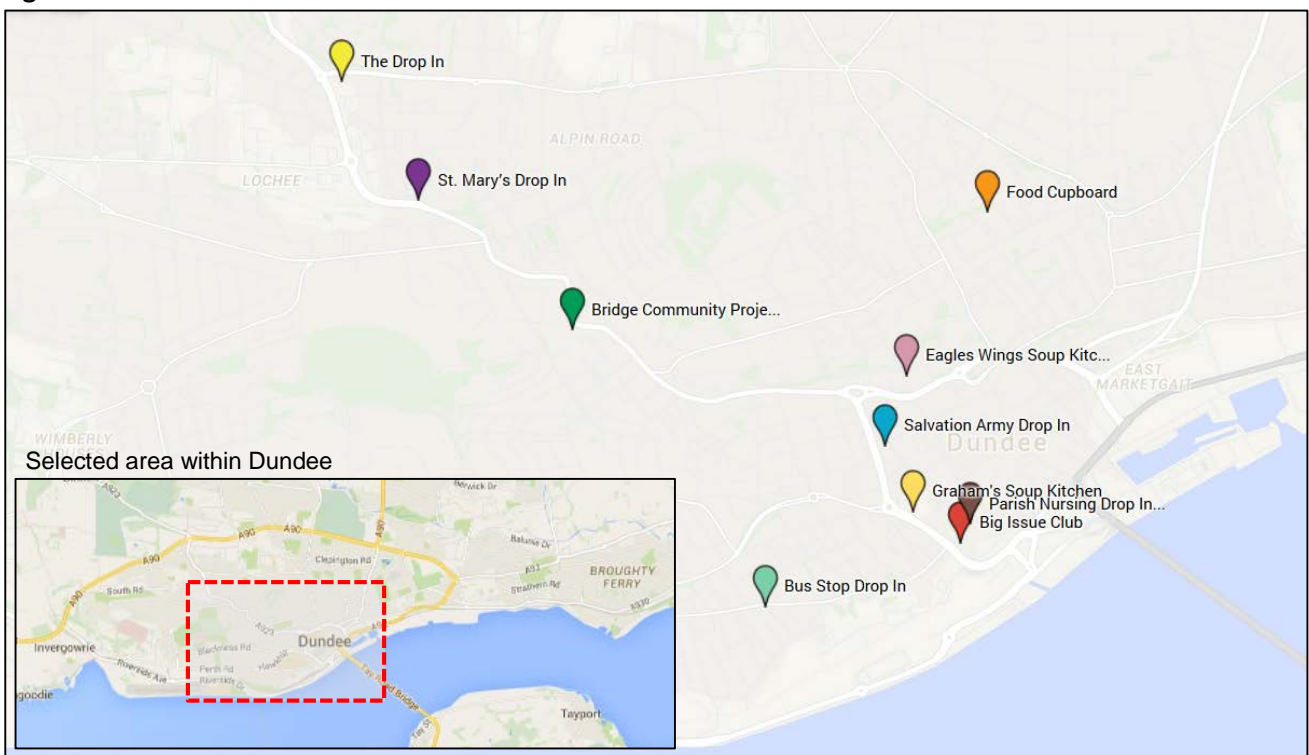
Figure - Distribution of DDI services in Dundee

One aspect identified in the survey is the concentration of DDI services in a specific geographic area of Dundee that surrounds the City Centre, spreading over DD1, DD2 and DD3 neighbourhoods. The fact most DDI users live in these areas may reflect the limited geographic reach of DDI services that tend to be localised. It indeed cannot be seen as a negative aspect of the services. In fact, the 'local' reach results in a good connection with local communities as we could observe during some visits and talks with DDI members and service users. In any case, parts of DD3 and the DD4 areas may be a 'frontier' to set up new DDI type services in support of people in poverty as reflects the Scottish Index for Multi-Deprivation (SIMD) for Dundee. At the time of reporting it is understood that a similar type of services have started in Whitfield (North East Ward – DD4), Stobswell (Maryfield Ward – DD3/4) and St. Mary's (North West Ward – DD3). In all cases these locations are developments in areas without any DDI type service.