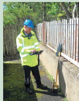
Routine inspection of retaining wall