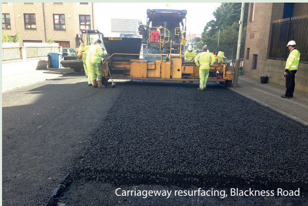
Carriageway resurfacing, Blackness Road